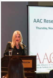
Ms. Eve Adams, Parliamentary Secretary to the Minister of Health

Learn more about the Peoples of the Longhouse: http://peoplesofthelonghouse.wordpress.com/